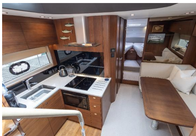
Princess V50 For Sale