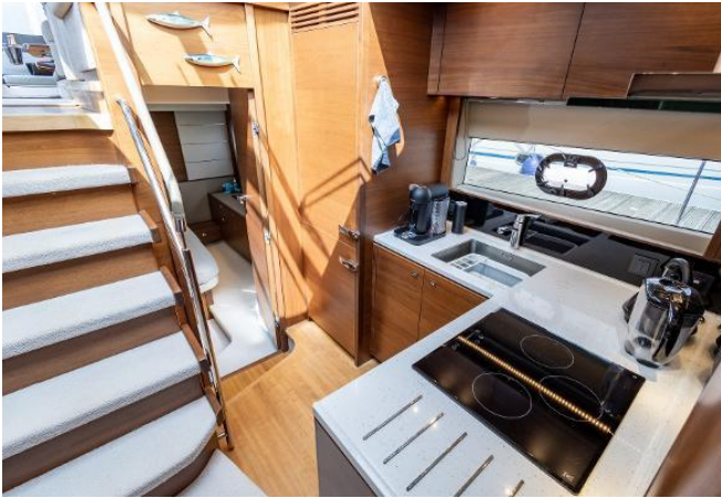
Princess V50 For Sale