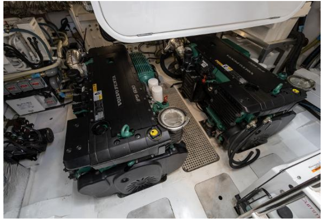
Princess V50 For Sale