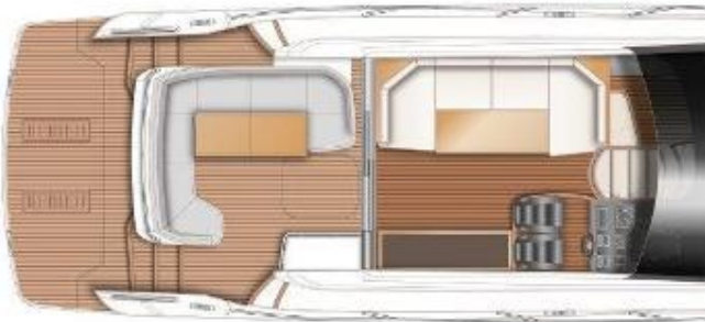
Princess V50 Upper Deck Layout Plan