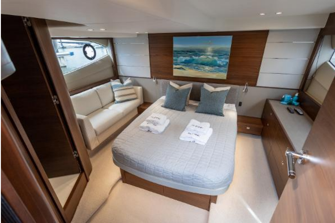
Princess V50 For Sale - Master cabin