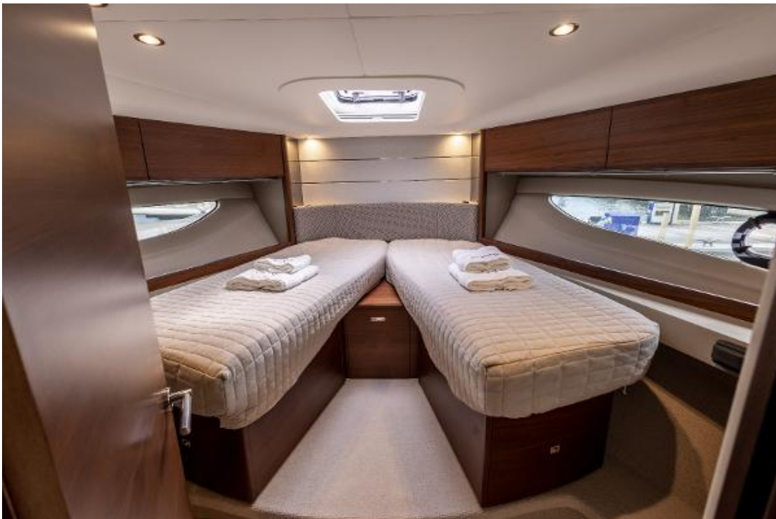
Princess V50 For Sale - Guest cabin