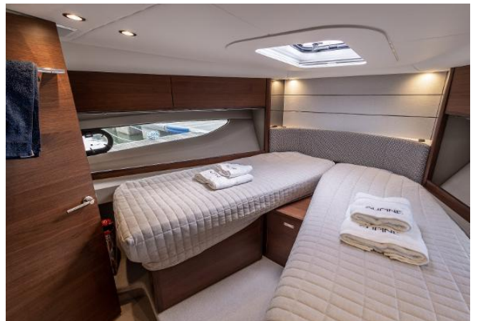
Princess V50 For Sale