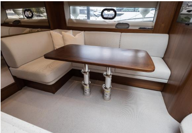
Princess V50 For Sale