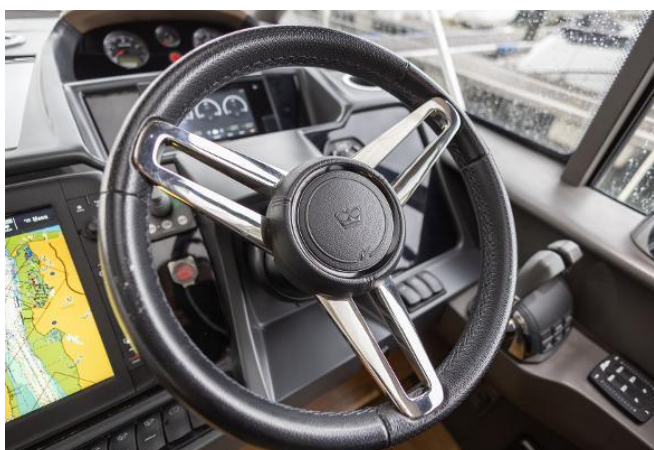
Princess V50 For Sale