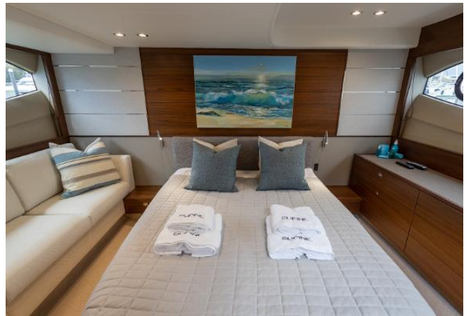
Princess V50 For Sale