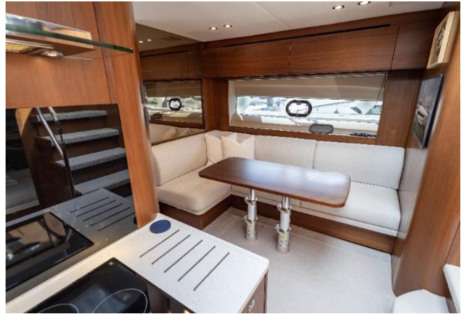
Princess V50 For Sale