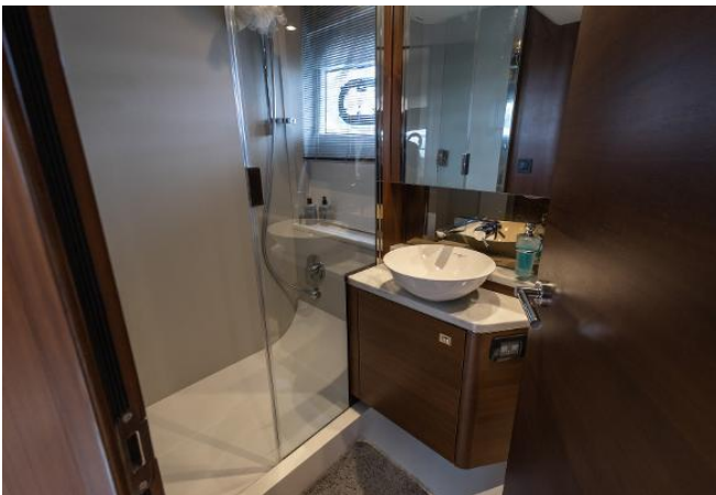
Princess V50 For Sale