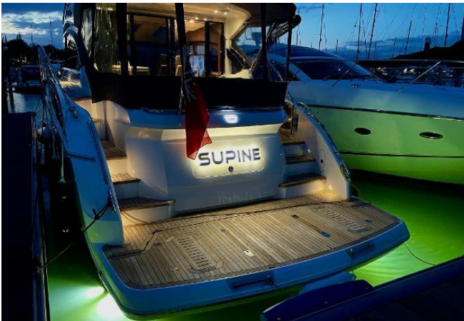
Princess V50 For Sale