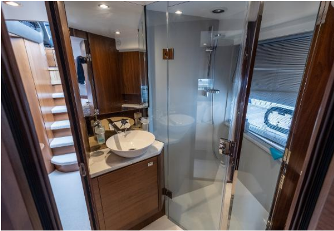
Princess V50 For Sale