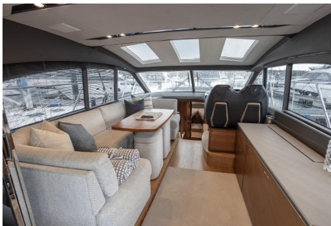
Princess V50 For Sale