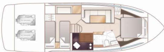
Manufacturer Provided Image: Princess V40 Lower Deck Layout Plan