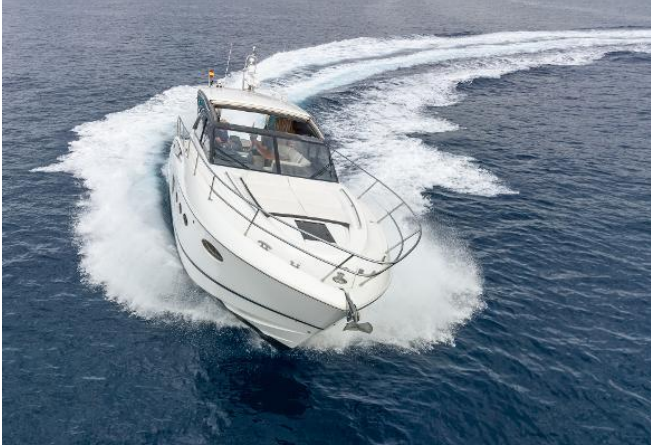
Princess V48 For Sale