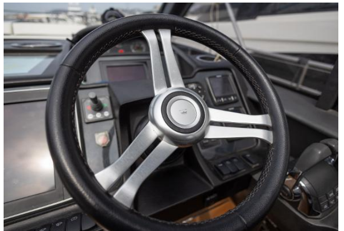
Princess V48 For Sale