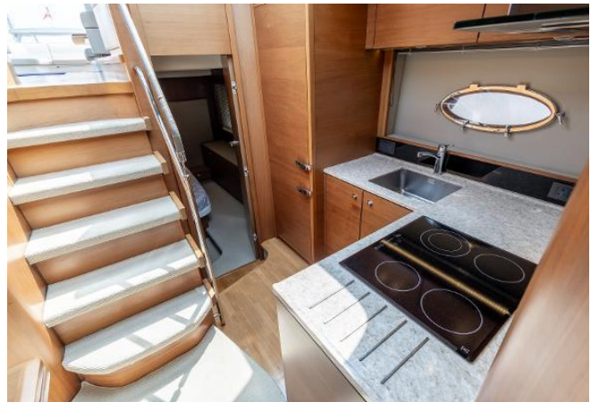
Princess V48 For Sale