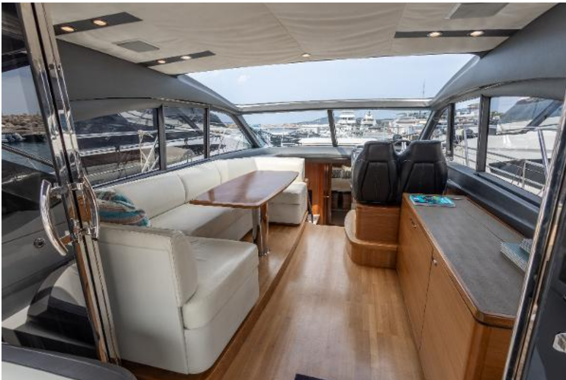
Princess V48 For Sale