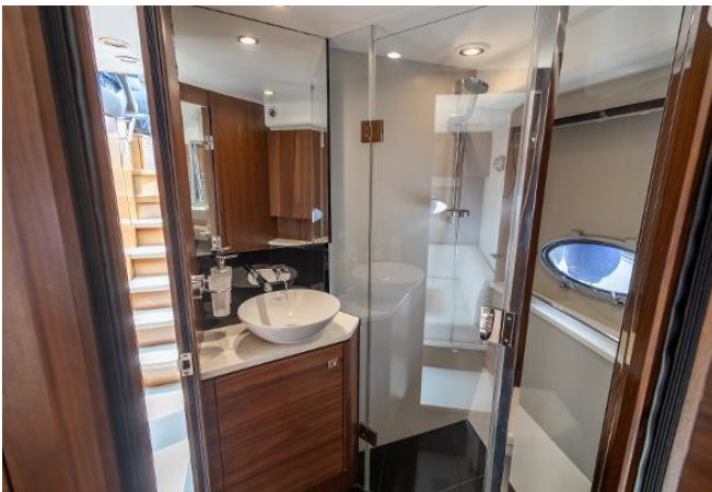
Princess V48 For Sale