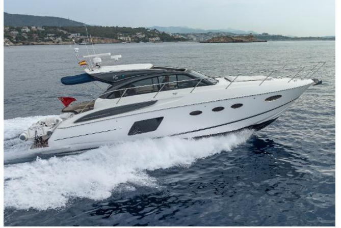
Princess V48 For Sale