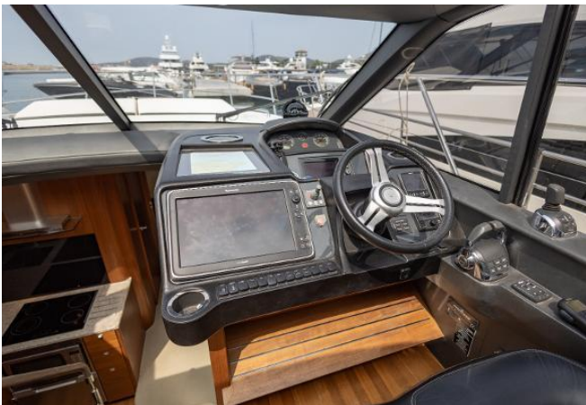
Princess V48 For Sale