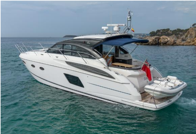
Princess V48 For Sale