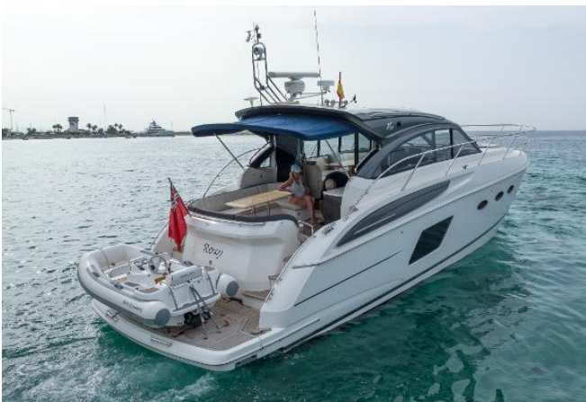
Princess V48 For Sale