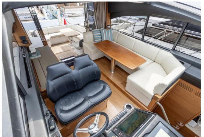
Princess V48 For Sale