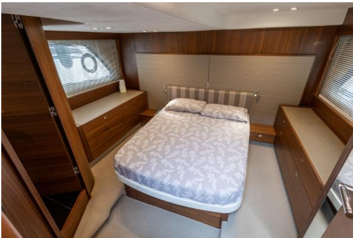
Princess V48 For Sale