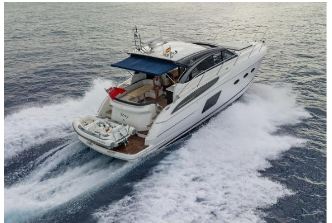
Princess V48 For Sale