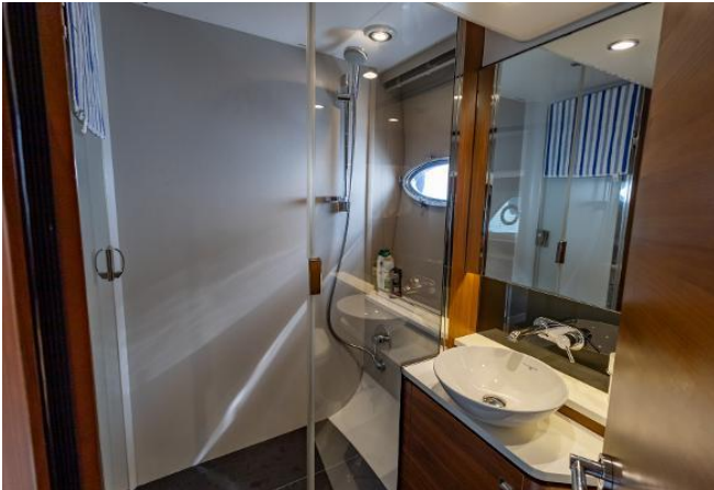
Princess V48 For Sale