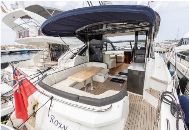
Princess V48 For Sale