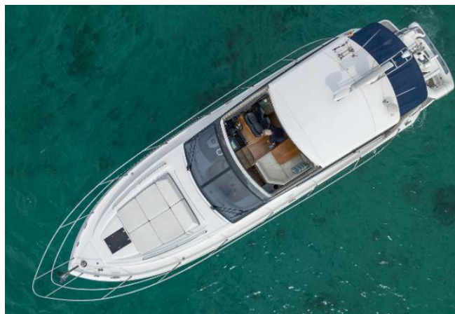
Princess V48 For Sale

FINANCE AND INSURANCE AVAILABLE ON THIS PRINCESS YACHT