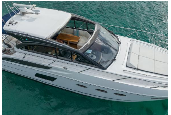
Princess V48 For Sale