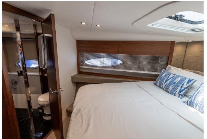
Princess V48 For Sale