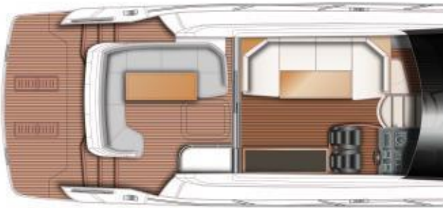
Princess V48 Upper Deck Layout Plan