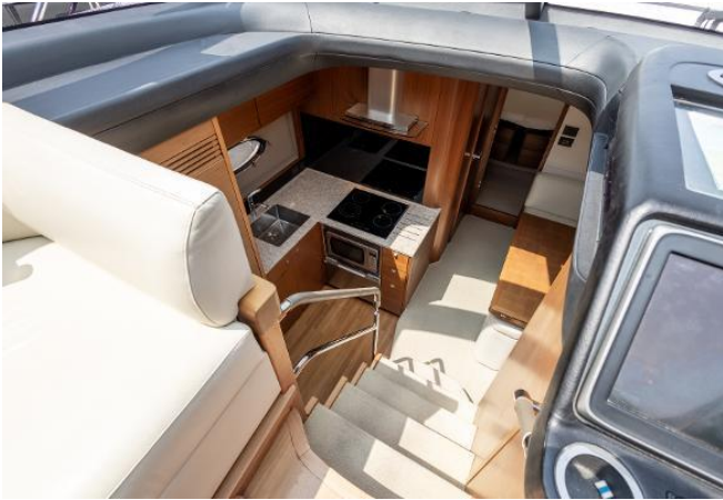
Princess V48 For Sale