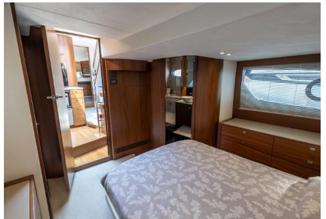
Princess V48 For Sale