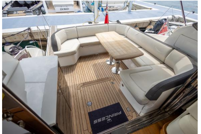
Princess V48 For Sale