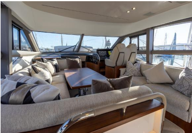
Princess F50 For Sale