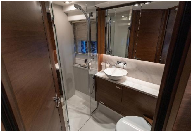
Princess F50 For Sale