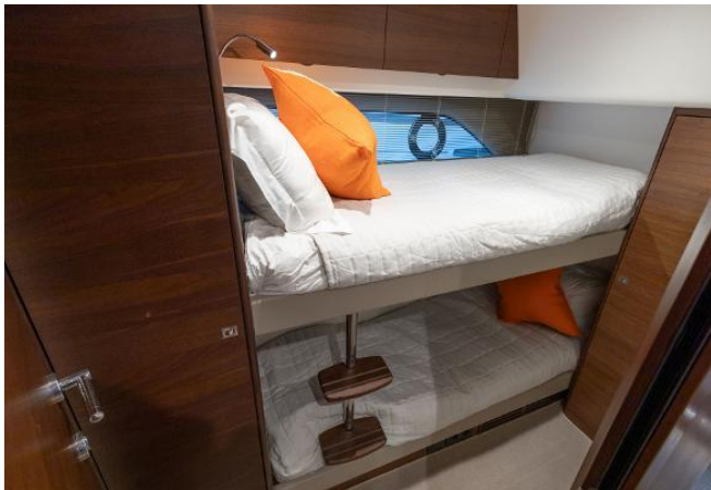
Princess F50 For Sale