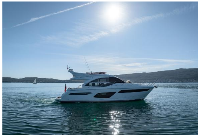
Princess F50 For Sale