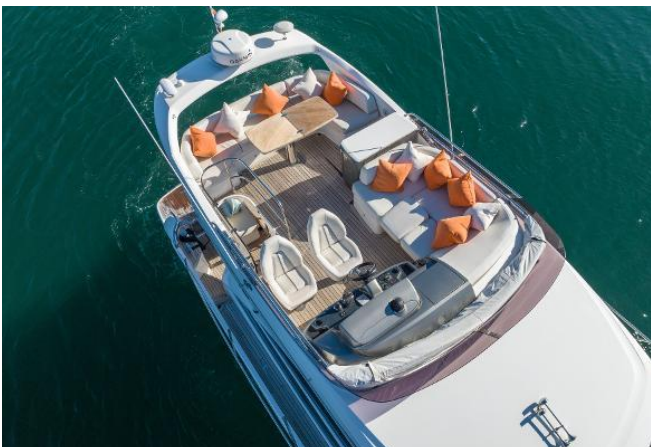
Princess F50 For Sale