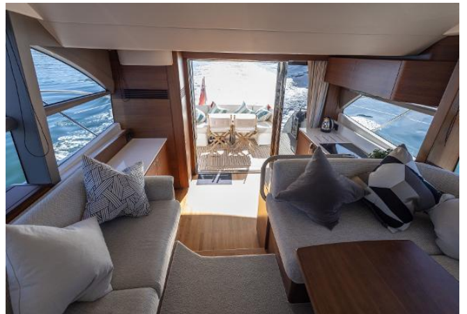
Princess F50 For Sale