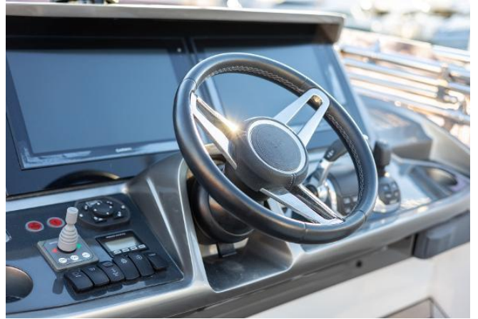
Princess F50 For Sale