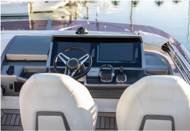
Princess F50 For Sale