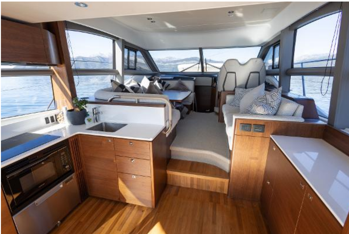
Princess F50 For Sale