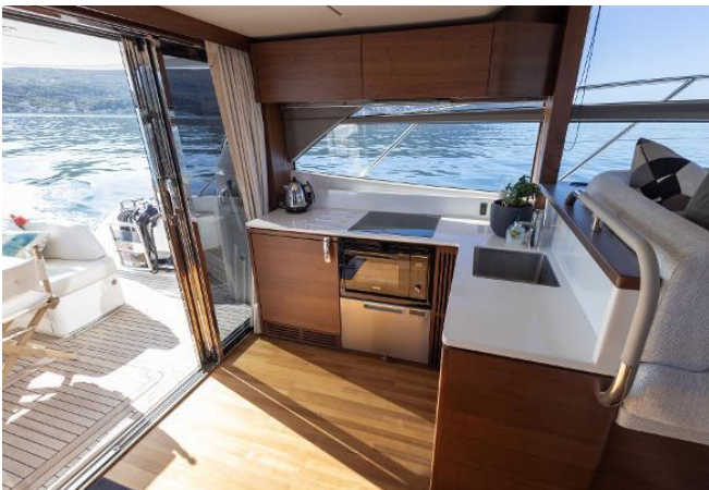
Princess F50 For Sale