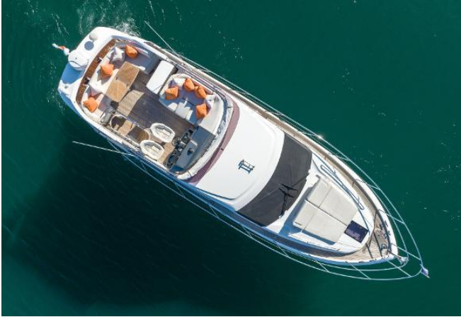
Princess F50 For Sale