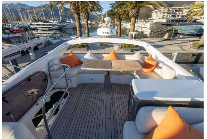
Princess F50 For Sale