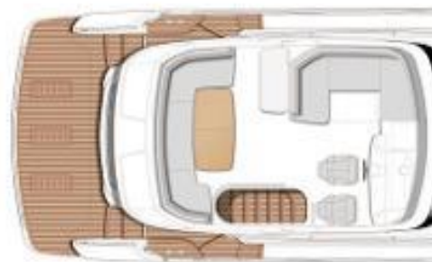
Princess F50 Flybridge Layout Plan