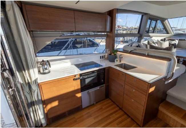
Princess F50 For Sale