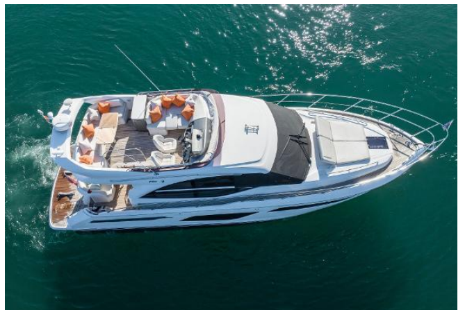
Princess F50 For Sale