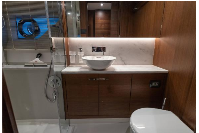
Princess F50 For Sale