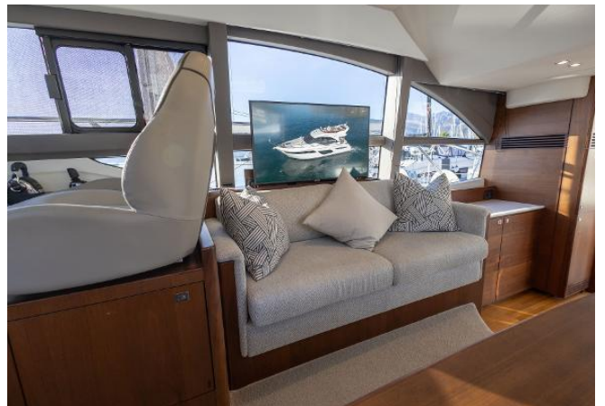
Princess F50 For Sale