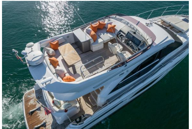
Princess F50 For Sale