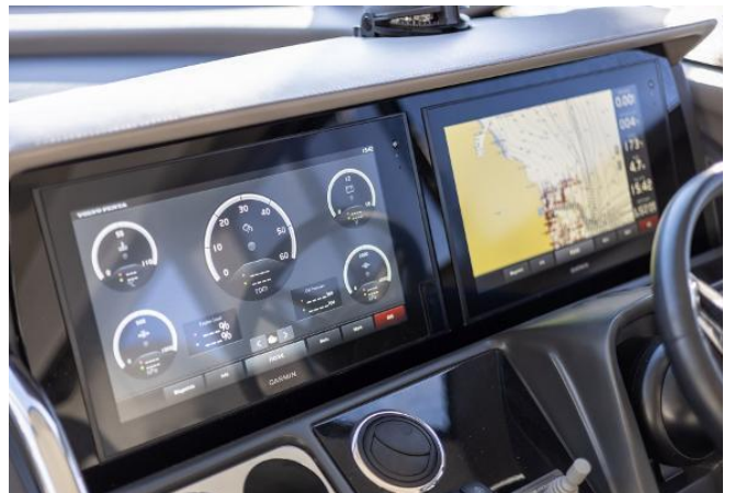
Princess F50 For Sale