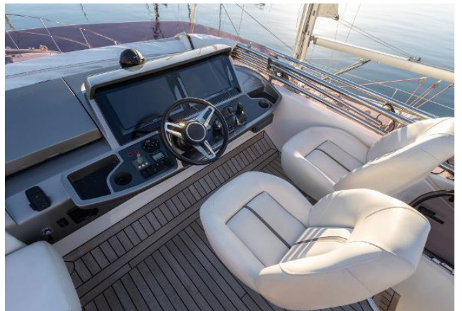
Princess F50 For Sale