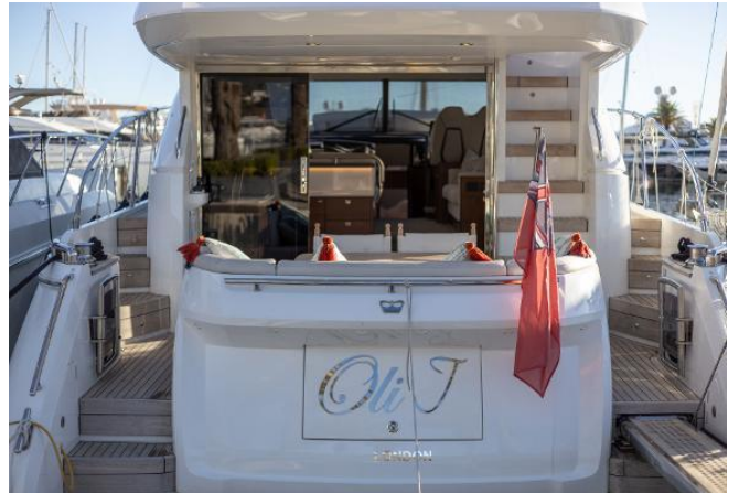
Princess F50 For Sale