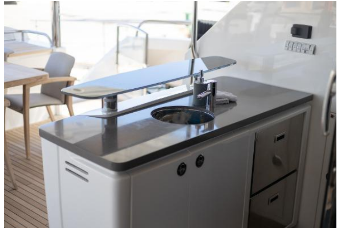
Princess 30M For Sale