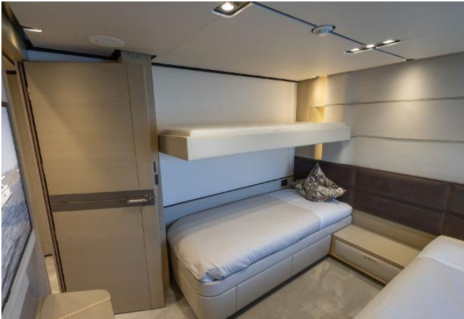
Princess 30M For Sale