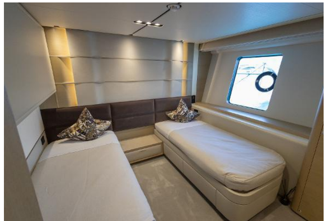
Princess 30M For Sale