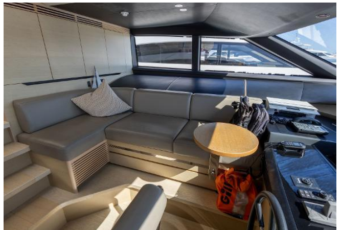
Princess 30M For Sale