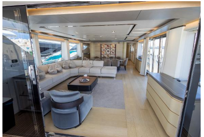
Princess 30M For Sale