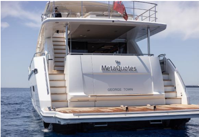
Princess 30M For Sale