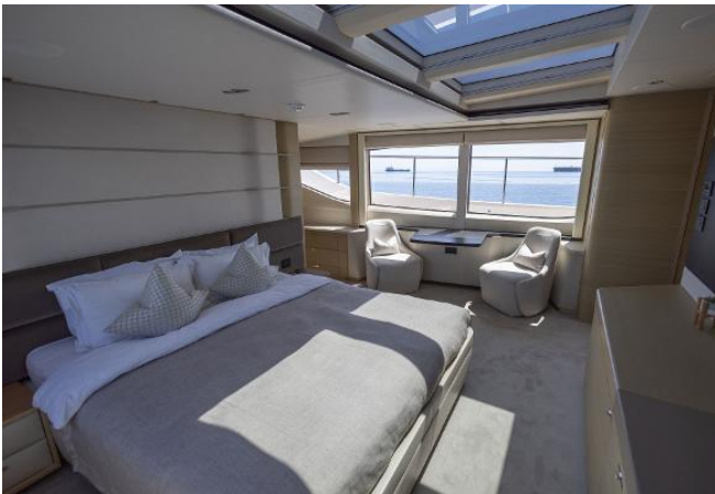
Princess 30M For Sale