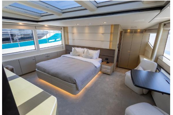
Princess 30M For Sale