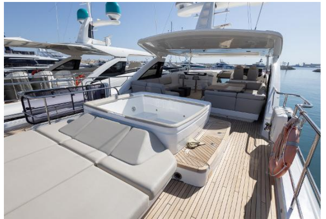
Princess 30M For Sale