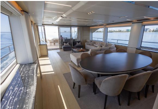
Princess 30M For Sale