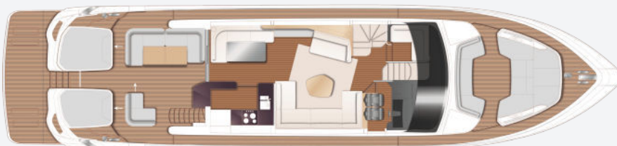
S78 Main Deck